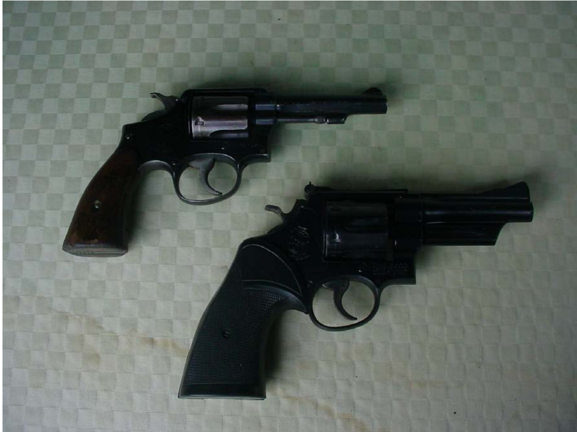
Smith & Wesson model 10 and model 28 revolver