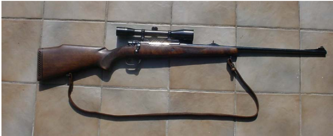
Repetierbüchse Mauser with scope 6x42

Semiautomatic rifles ( Selbstladebüchsen )