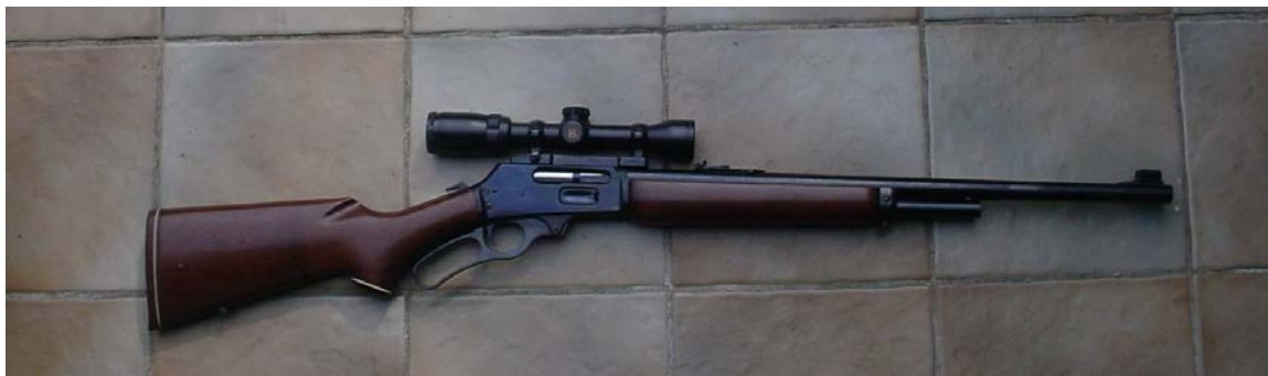
Unterhebelrepetierer with scope