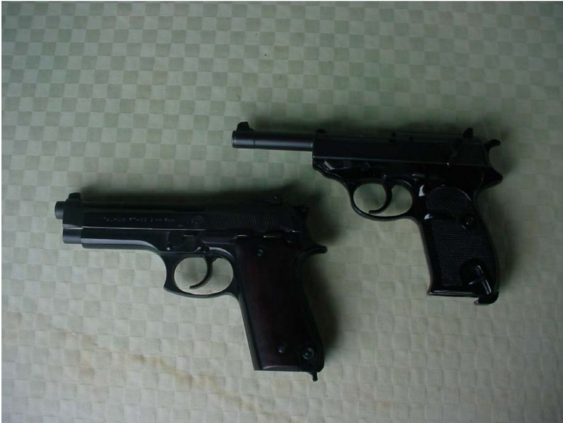
Taurus and Walther pistols

Semiautomatic pistols ( halbautomatische Pistolen or Selbstladepistolen )