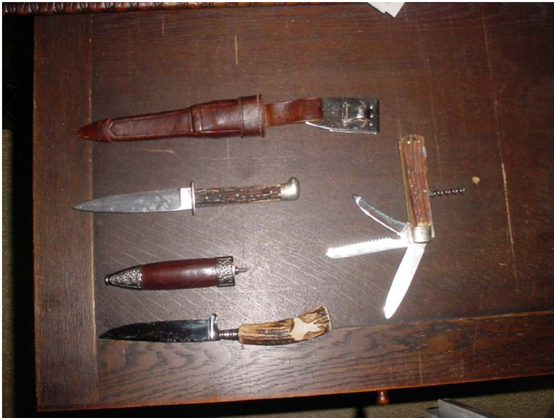
Left side: typical sheath knives

The saw on hunting knives is used to cut the pelvic joint when gutting game; when a sheath knife is used, the pelvic joint will be broken using the point of the blade.